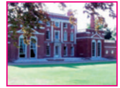
Hinxton Hall, Cambridge

26th June 2012 NGS – Technologies & Future Applications Hinxton Hall, Cambridge