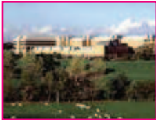
AZ, Alderley Park

Daily Lunchtime Seminar: Informatics – Making Knowledge from Lab Data