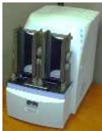
EnVision® Xcite Multi-label Reader