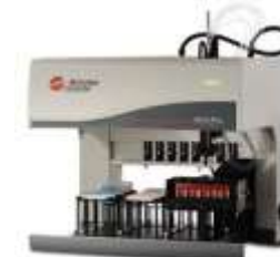
Biomek® NXP Laboratory Automation Workstation