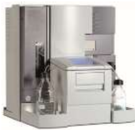
Biacore T200 SPR Reader

Fragment binding Binding kinetics Hit validation