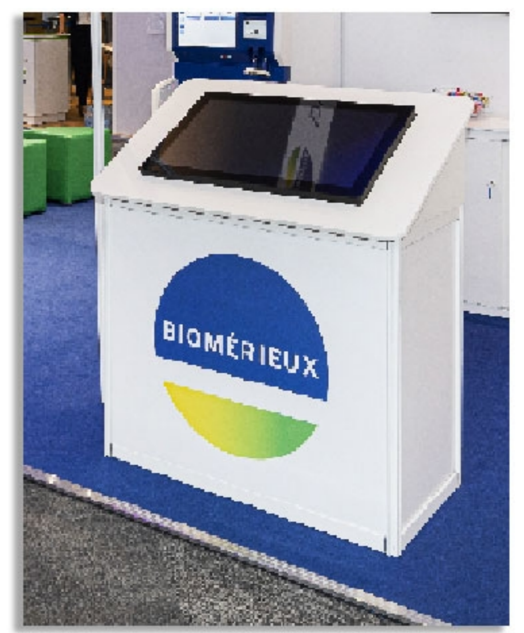
TOUCHSCREEN: MOUNTED IN CUSTOM PLINTH UNIT