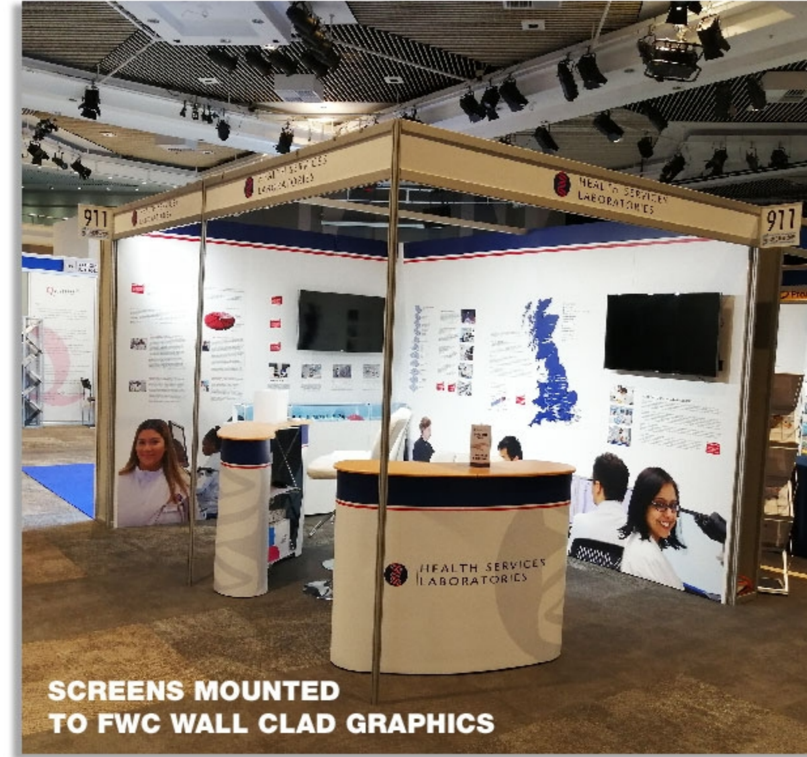
SCREENS MOUNTED TO FWC WALL CLAD GRAPHICS