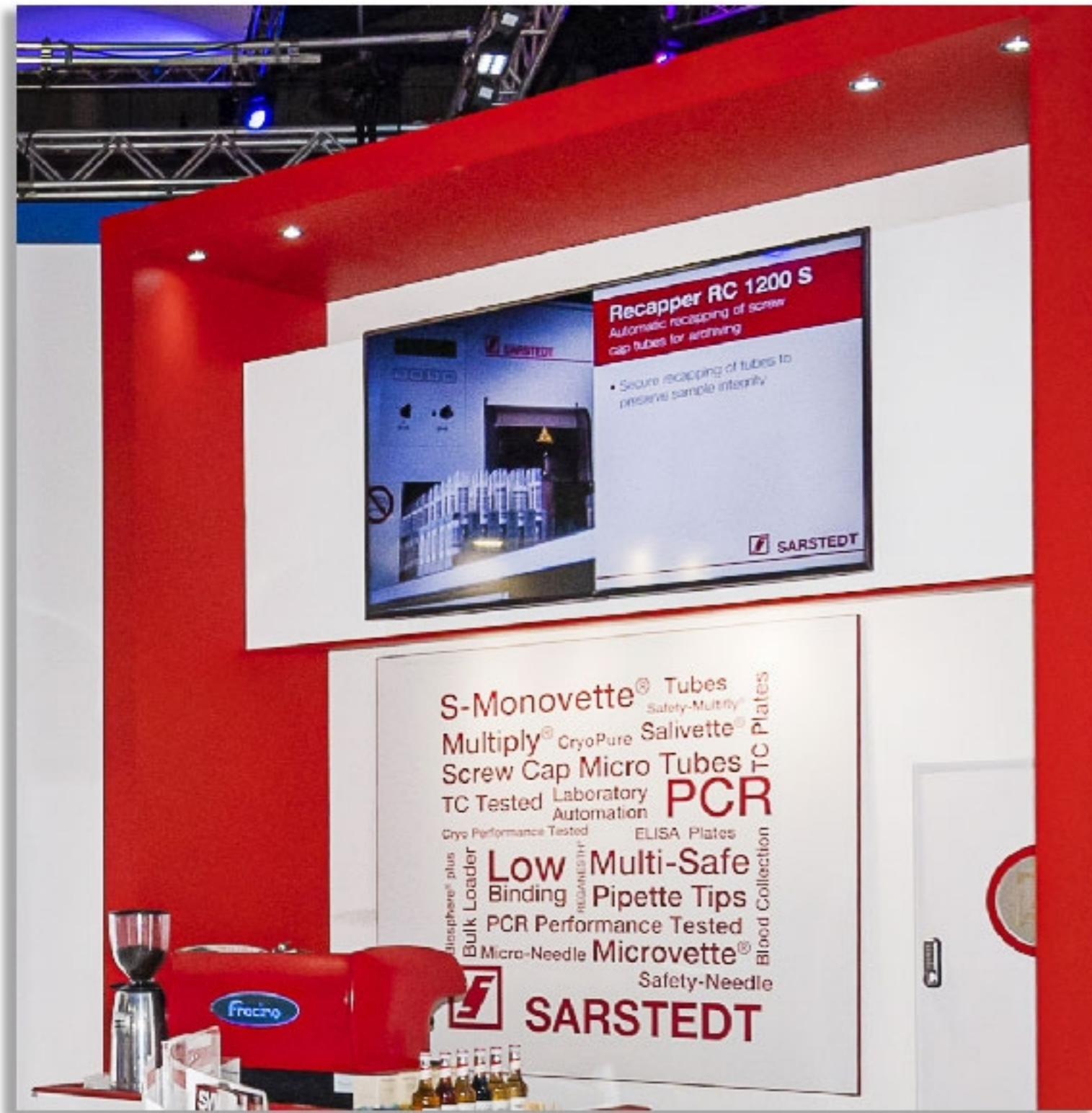
50" LED SCREEN ON CUSTOM MOUNTING PANEL