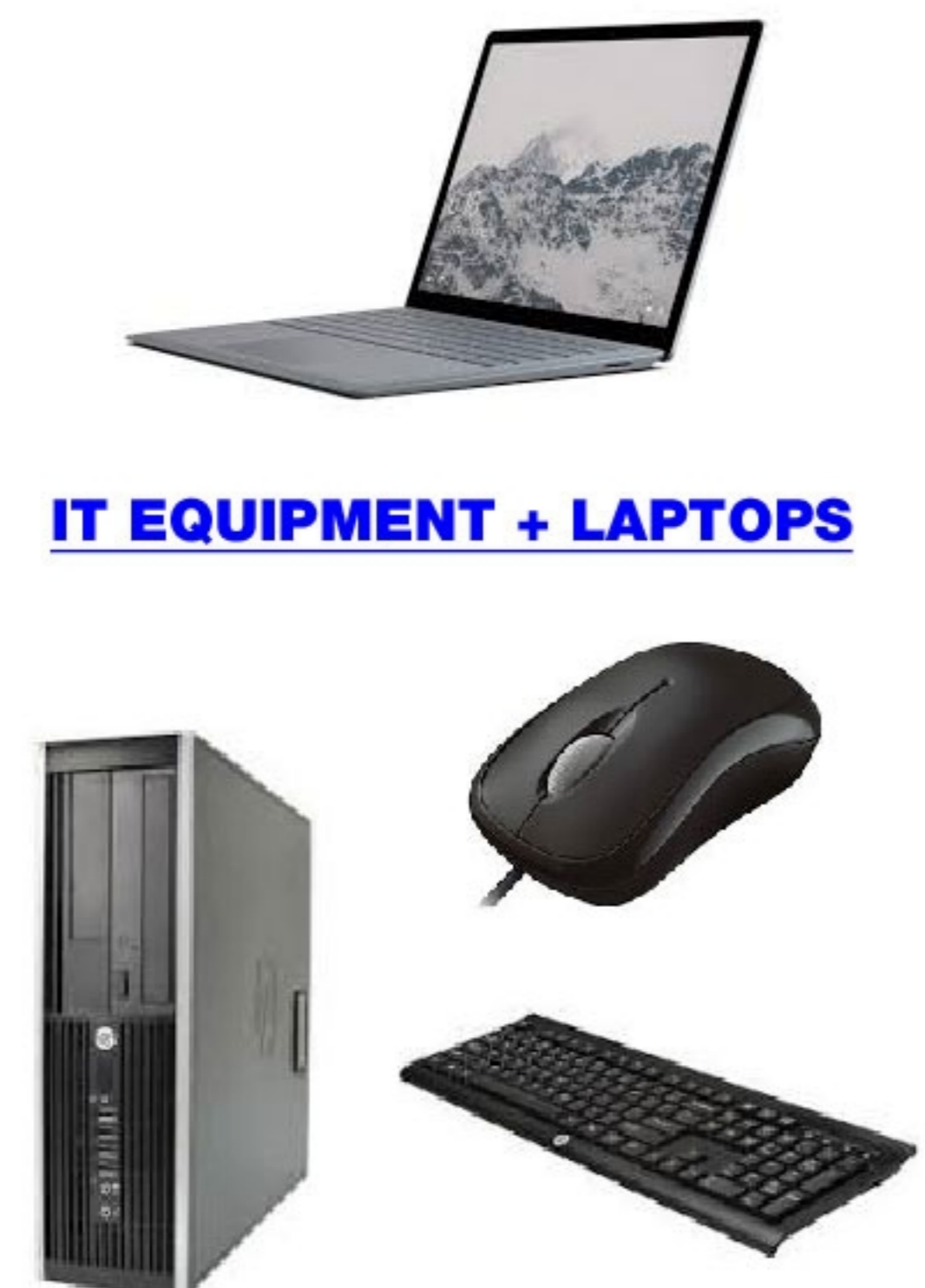
IT EQUIPMENT + LAPTOPS