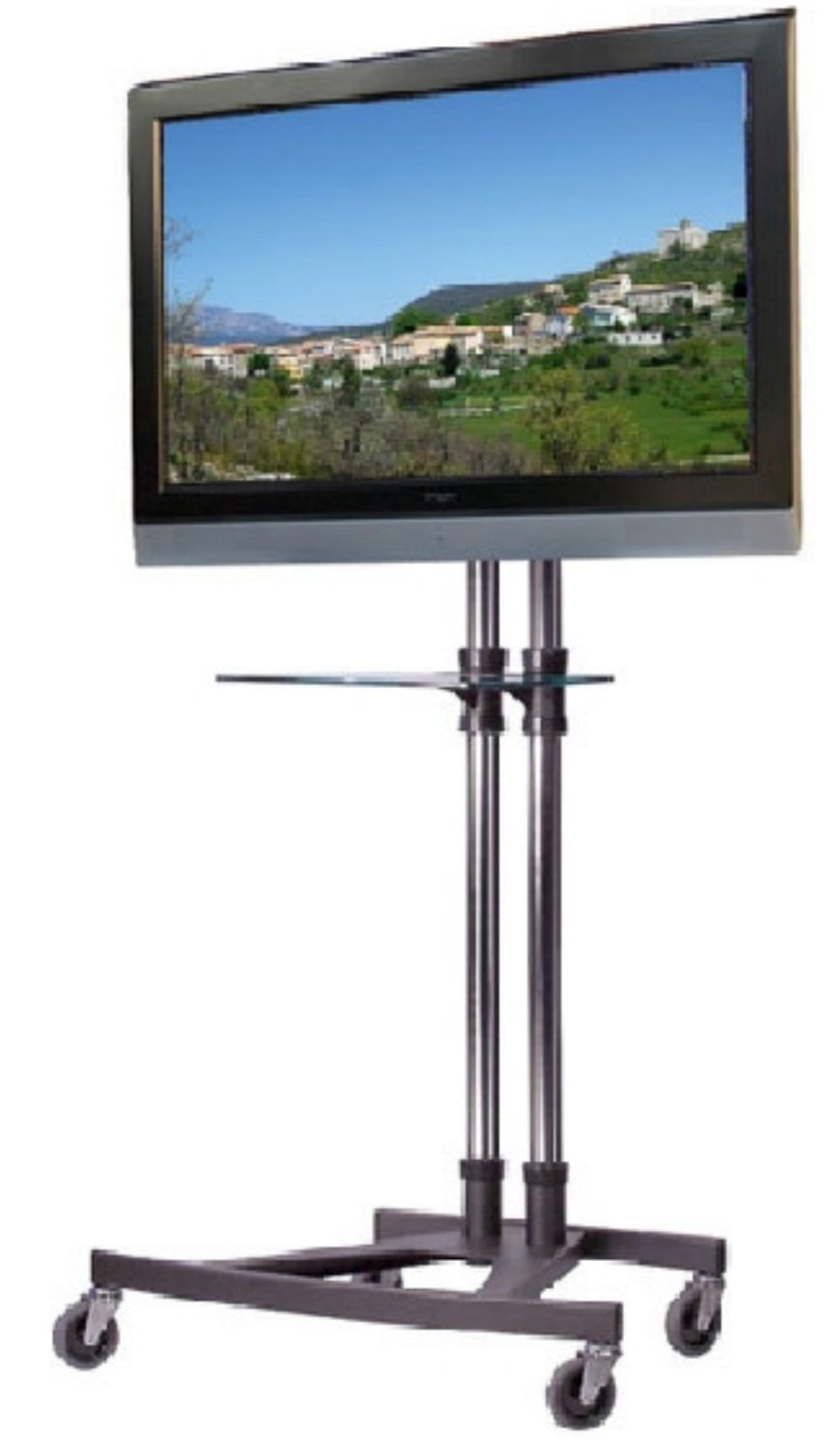
SCREENS ON FLOORSTANDS