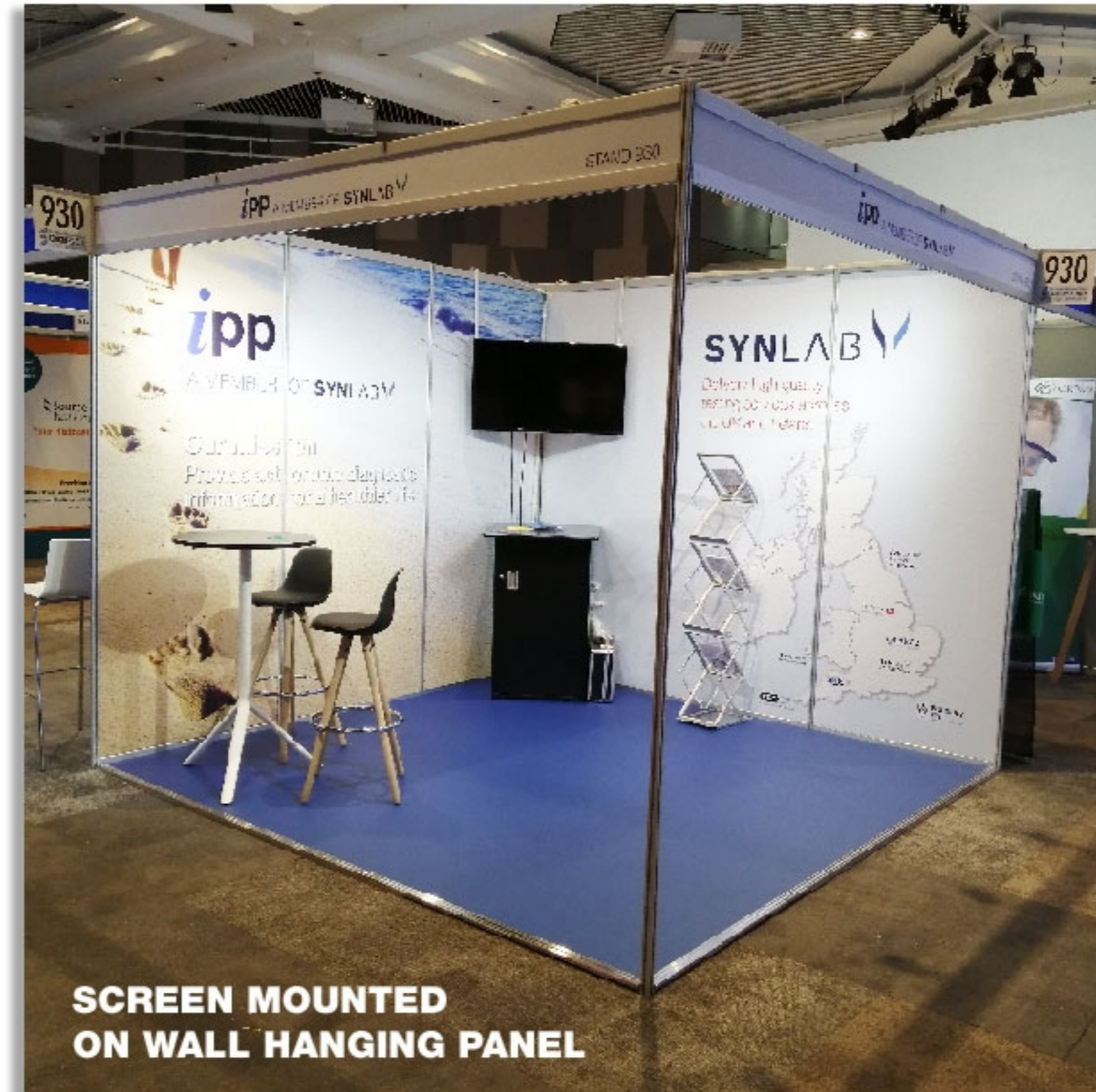
SCREEN MOUNTED ON WALL HANGING PANEL