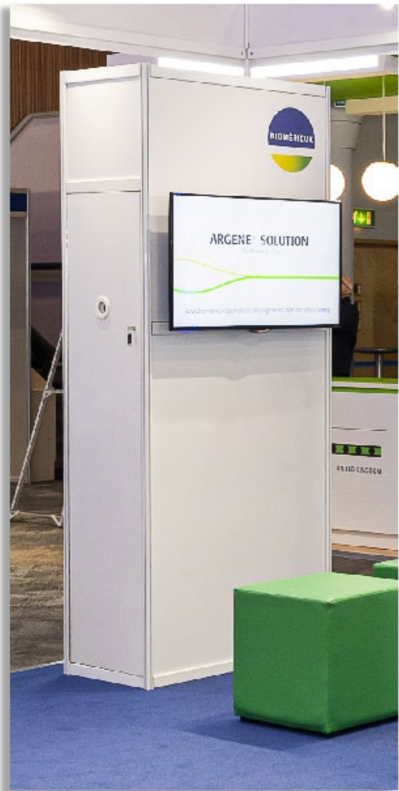
40" LED ON CONCEALED MOUNT