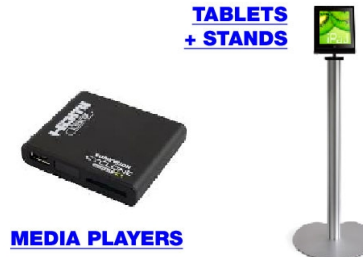
TABLETS + STANDS